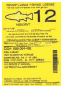
POINT-OF-SALE LICENSE Permits are printed on the license.

One-Day Tourist and One Day Resident License - One-Day Tourist and One-Day Resident Licenses are not valid for fishing during the period from March 15th to April 30th of any year. One-Day Tourist or One-Day Resident licenses issued to be used on March 14 will expire at 11:59 p.m. on March 14 regardless of what time the license begins.